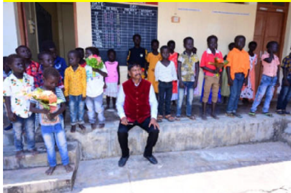
Hon'ble Union Minister of Tribal Affairs at Dugong Creek