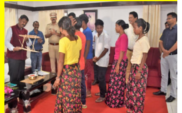
Hon'ble Union Minister of Tribal Affairs at Campbell Bay